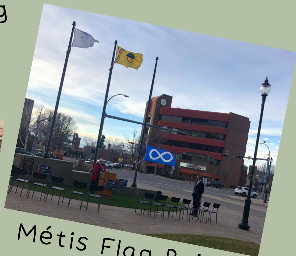
Métis Flag Raising