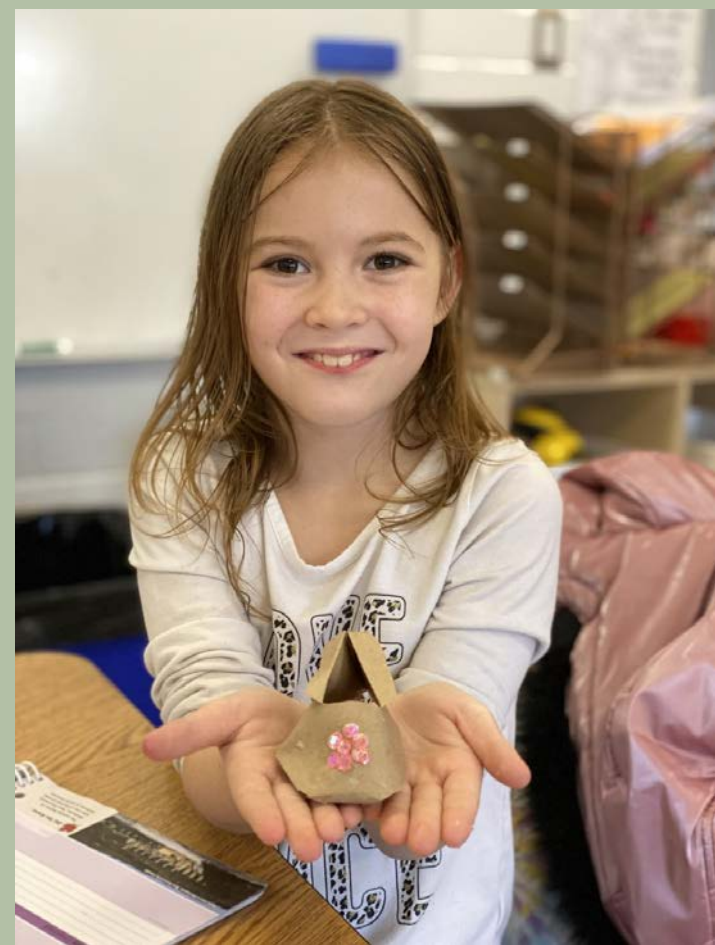
Buchanan Rock your Mocs