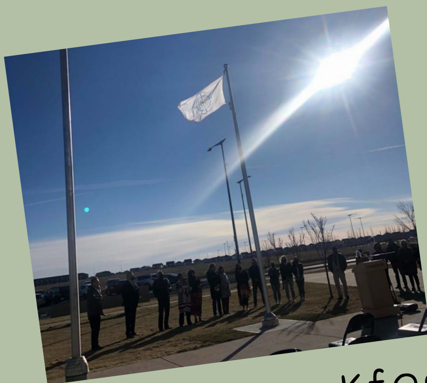
Chinook Blackfoot Flag Raising