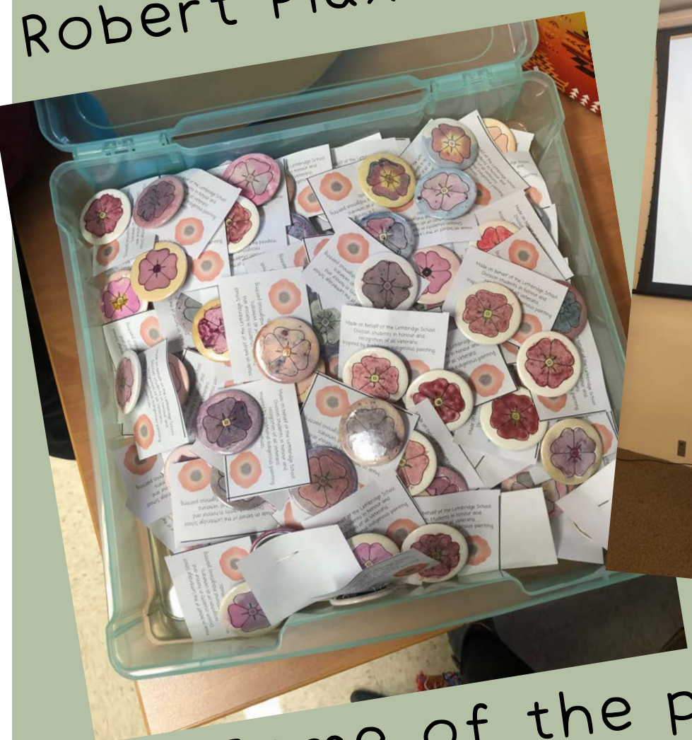
Some of the poppies donated to the Legion