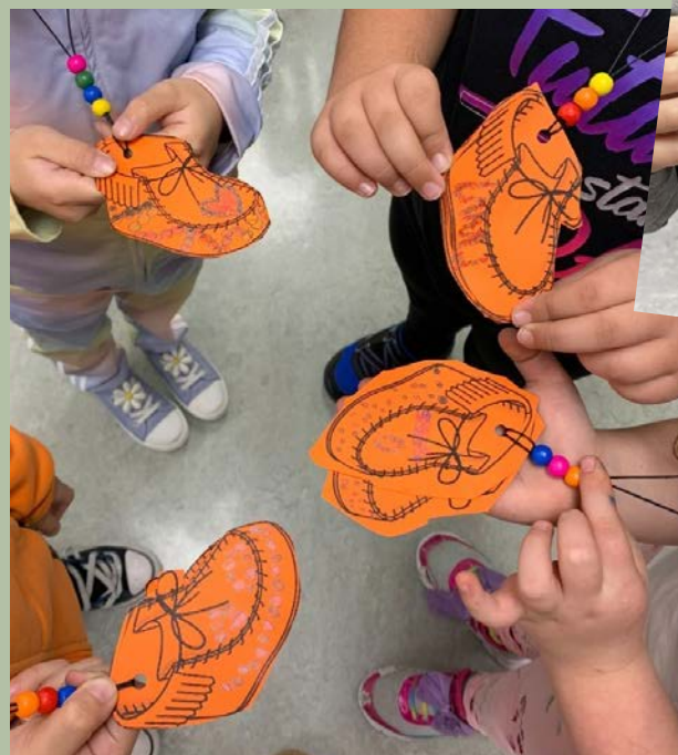
Probe Rock your Mocs