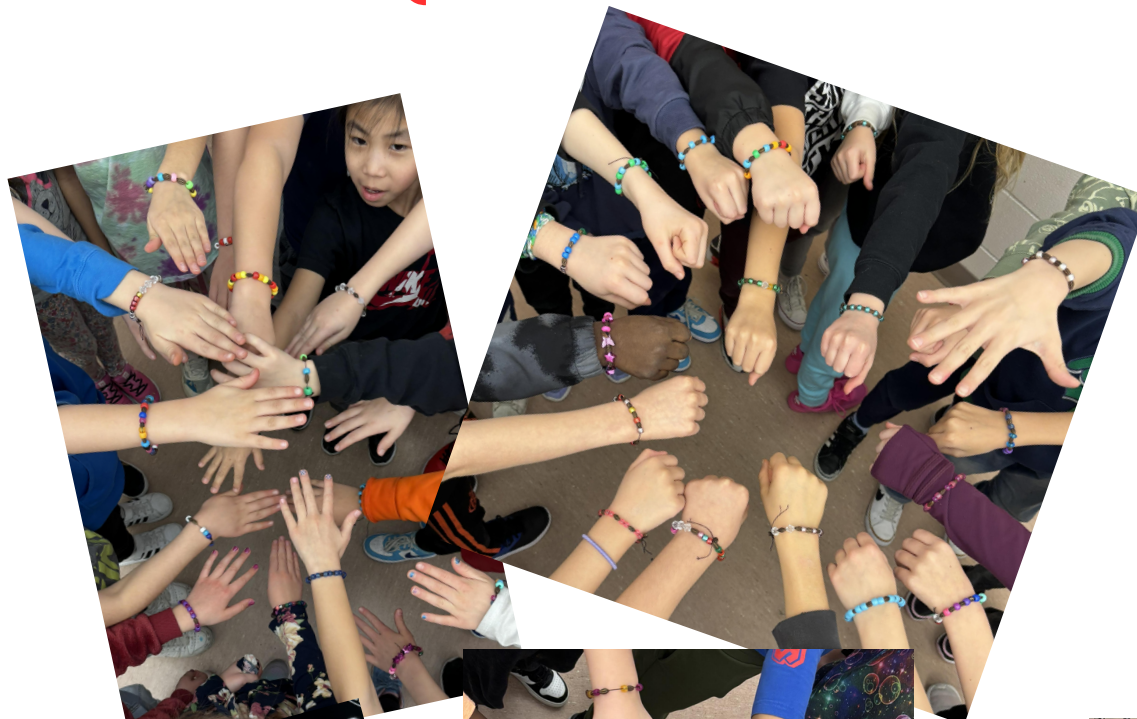
Wolf Willow bracelets @ Probe