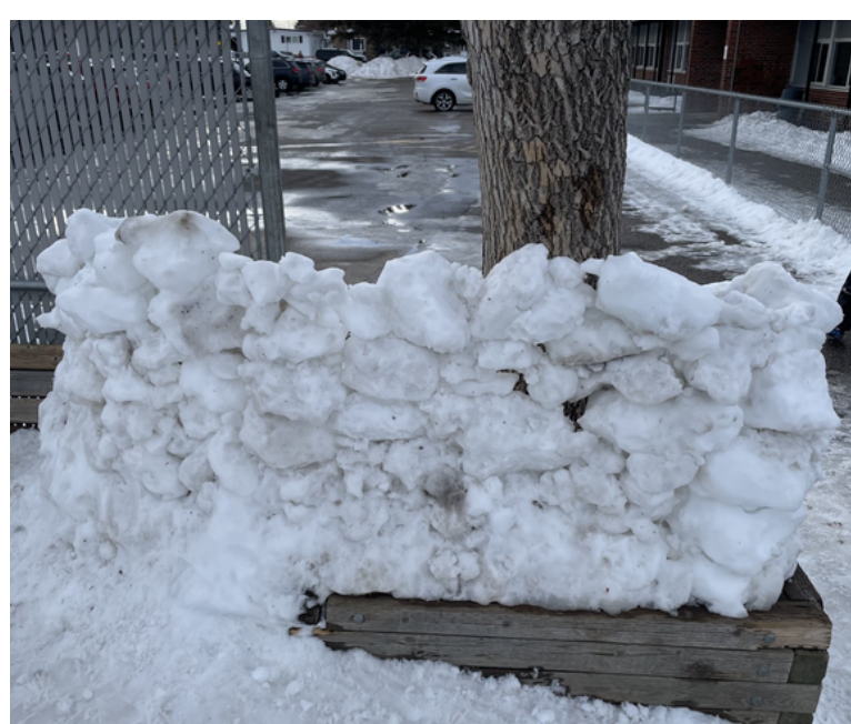
Agnes Davidson students built an igloo!