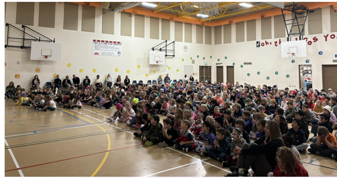
Learning about the Buffalo @ Probe