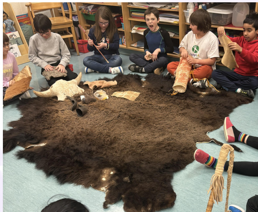
Buffalo Kit @ Fleetwood