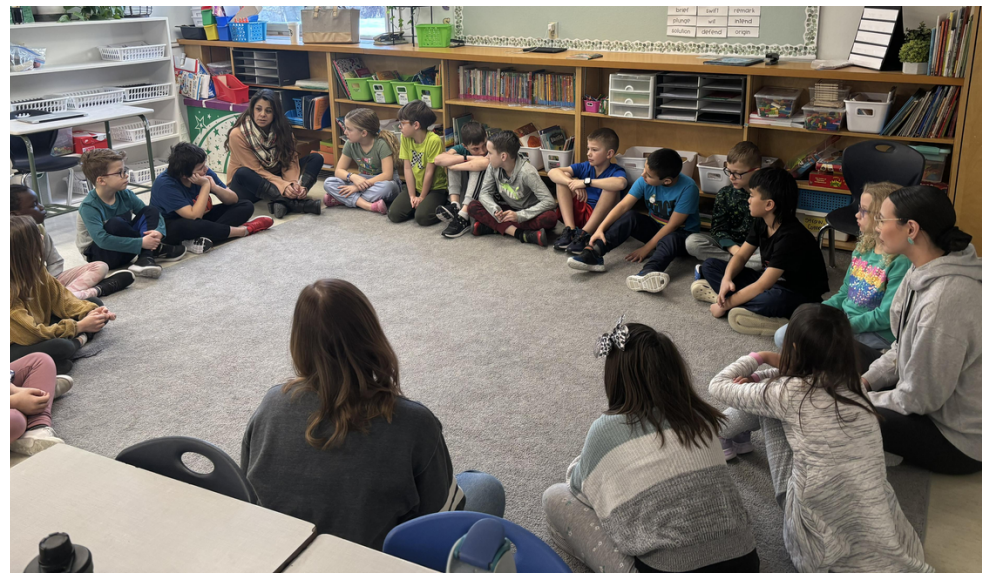
We got to attend a Sharing Circle @ Nicholas Sheran