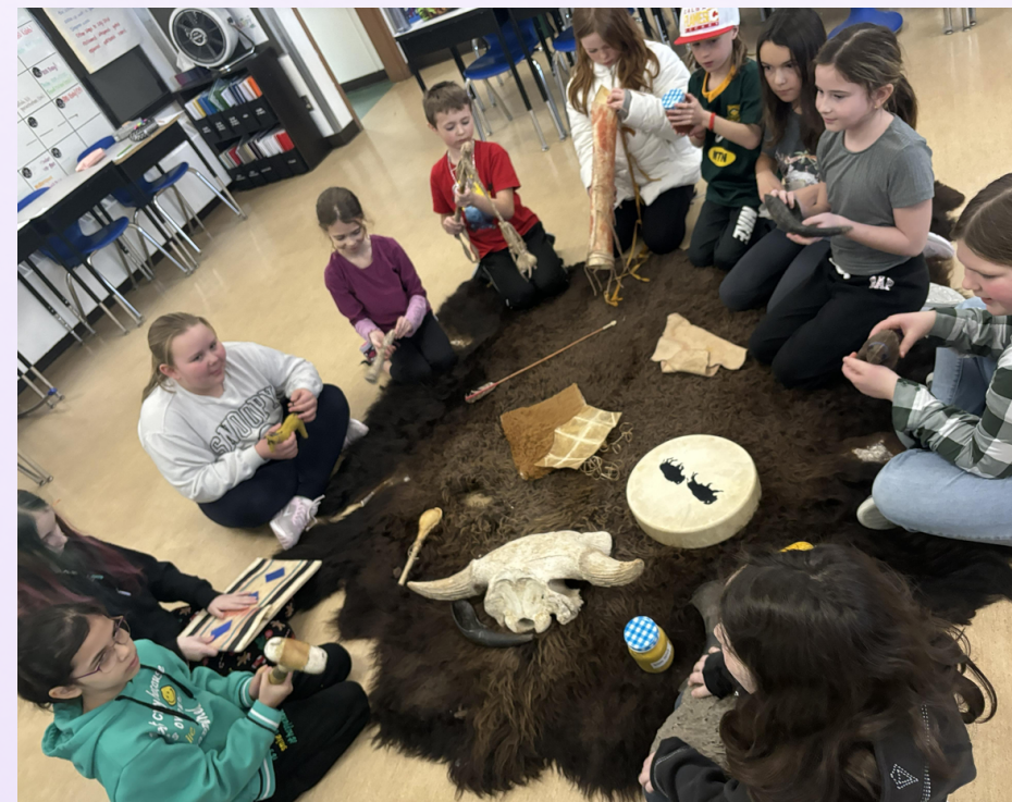
Buffalo Kit @ Park Meadows