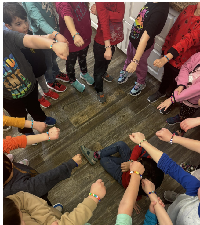
Wolf Willow Bracelets @ ICES