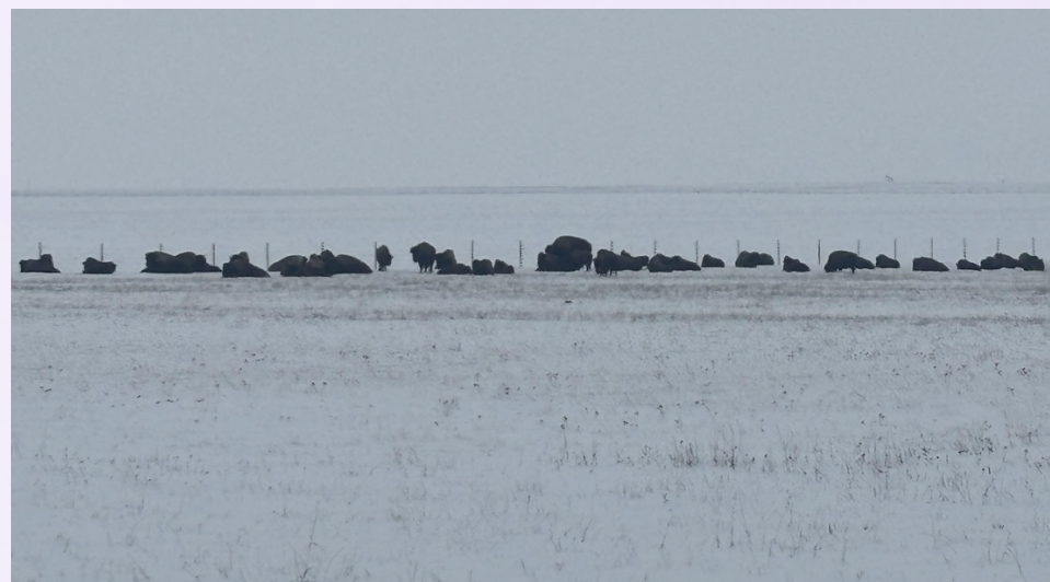
Learning about the Buffalo on the Blood Reserve