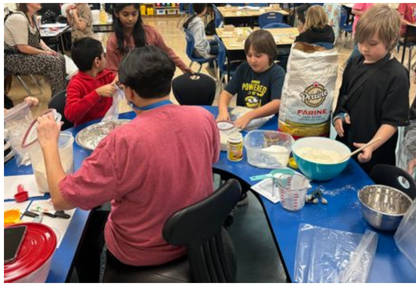
Made Bannock @ Fleetwood